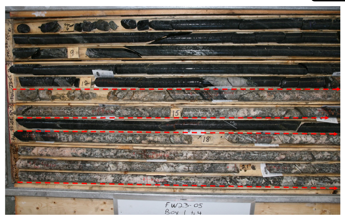
Figure 1. Borehole FW23-05 Core Samples showing high-grade (>1.3% Li₂O) spodumene mineralization (Far West South "FWS" Pegmatite)