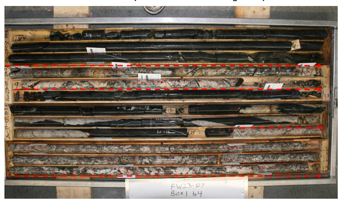
Figure 2. Core showing high-grade (1.5% Li<sub>2</sub>O) spodumene mineralization in Hole FW23-07 (Far West North "FWN" Pegmatite)