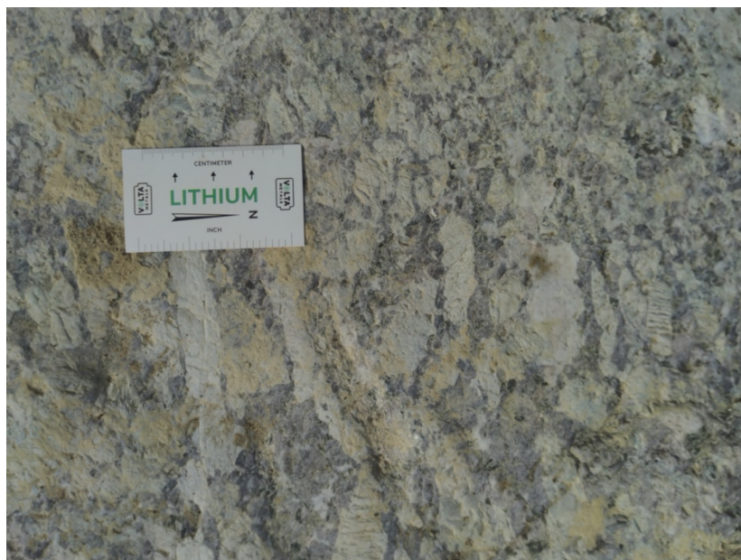
Figure 2. Large spodumene crystals in the AM pegmatite