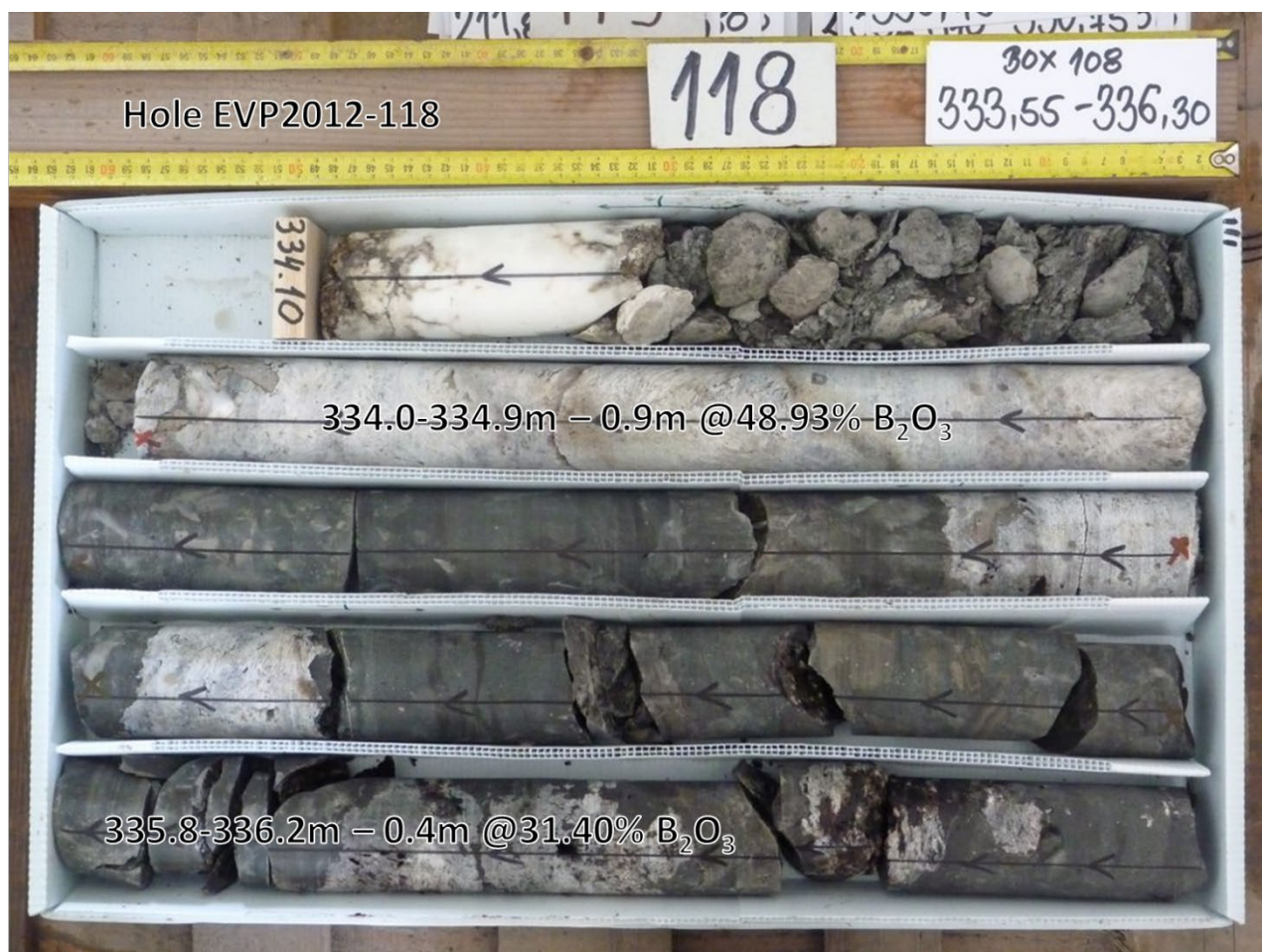
Figure 2 Drill Hole EVP2012-118 showing high grade boron mineralization

Piskanja is Erin Ventures' wholly owned boron deposit with an indicated mineral resource of 7.8 million tonnes (averaging 31.0% B 2 O 3 ), and an inferred resource of 3.4 million tonnes (averaging 28.6% B 2 O 3 ). Calculated in accordance with the Canadian Institute of Mining Definition Standards on Mineral Resources and Reserves ("CIM Standards") as disclosed in Erin Ventures' report titled "Mineral Resource Estimate Update on the Piskanja Borate Project, Serbia, October 2016 – Amended February 28 2019" prepared by SRK Consulting (UK) Ltd. The responsible persons for the Updated Mineral Resource Estimate are Dr. Mike Armitage (C.Eng., C.Geol.) and Dr. Mikhail Tsypukov, both of whom are full-time employees of SRK and Qualified Persons in accordance with CIM Standards and independent of Erin Ventures.