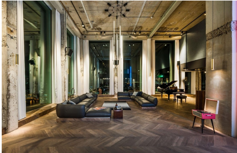
Pictured: A'Dam the Loft