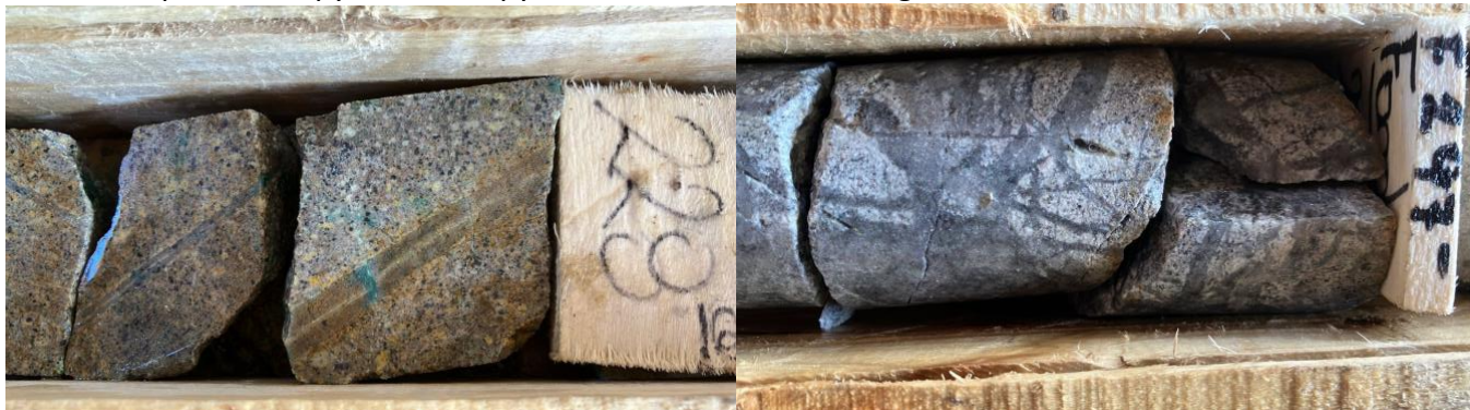
Images 1 & 2: Porphyry qtz stockwork veining with oxide copper mineralization (Left) and supergene enrichment (Right)

Dense porphyry A-type quartz vein stockwork with chalcopyrite and traces of disseminated bornite mineralization hosted in potassic altered diorite porphyry was intersected from 350m to approximately 650 m downhole. From 650m to approximately 740m a zone of moderate intensity quartz veining was intersected, prior to a zone of sporadic quartz veining which remains open at 867m (EOH). From 730m intermediate argillic alteration is present, as is molybdenite, sphalerite and hematite/specularite associated with grey sericite-chlorite veining and fine-grained disseminated chalcopyrite-bornite. From 830m the host-rock is volcanic, superimposed by sericite-chlorite alteration and disseminated hematite/specularite-pyrite-chalcopyrite mineralization, veining and breccias.