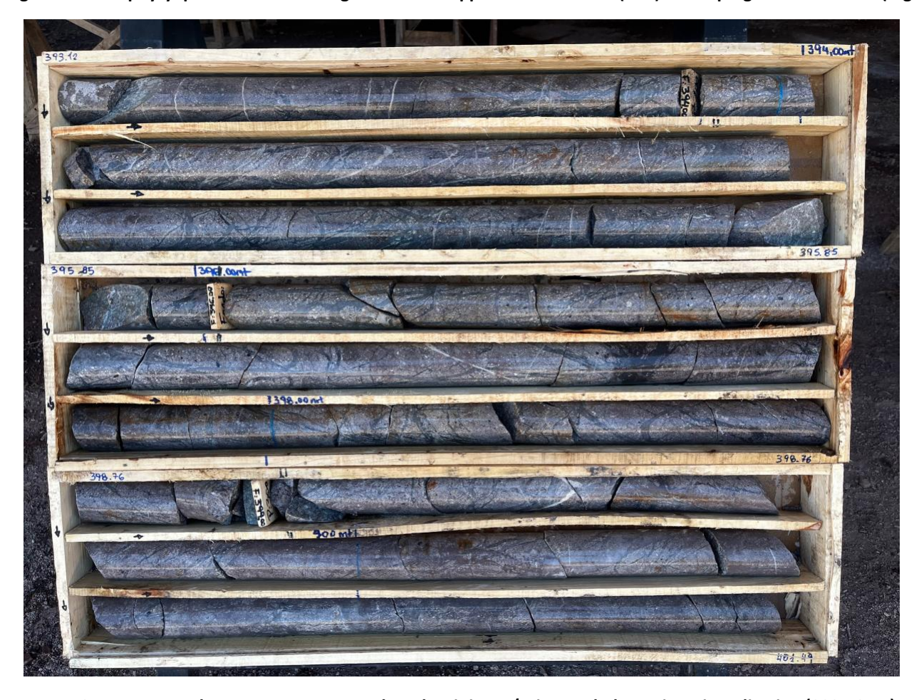
Image 3. Intense Porphyry A type quartz stockwork veining w/primary chalcopyrite mineralization (393-401m)