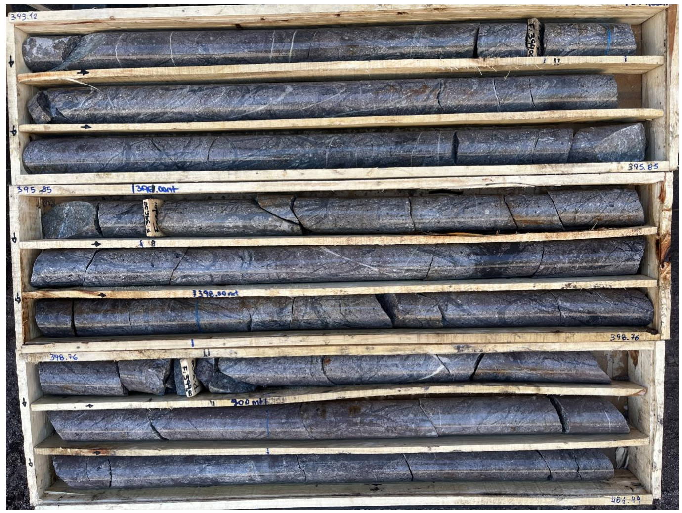
Image 2: PIU-01 drill core displaying strong Porphyry qtz vein stockworks overprinting potassic altered diorite porphyry intrusion.