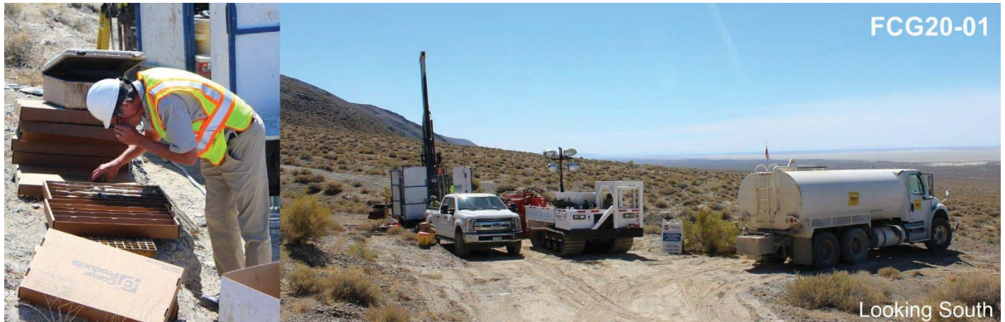
Figure 3: Fondaway Canyon Pediment Target Area drill hole FCG20-01 looking South

The 2002 drill samples from the two reverse circulation drill holes were split with a Jones splitter when dry and a rotary splitter when wet. Quality control samples from the field (i.e. field duplicate samples) were not submitted for analysis and the sample sizes and security measures were not documented. The samples were analyzed for total gold by American Assay Laboratories of Sparks, Nevada Assays using the fire/A.A. finish method on a 30-gram sample. The QAQC protocol employed by the laboratory was conducting duplicate analyses of core pulps, approximately 1 per 11 samples. The laboratory did not insert blanks and standards, a current NI 43-101 standard. A qualified person from Getchell has verified that the 2002 drill program results disclosed used procedures that are non-NI 43-101 compliant, however, the results have been accurately transcribed from the original source and are considered suitable for their current use.