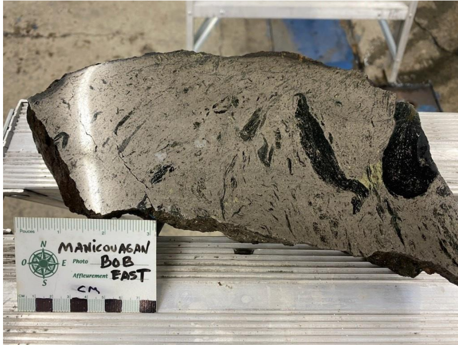
Polished sample from the current bulk sample from the Bob Showing.

A section of hole 18 has grabbed the attention of the Company's geological team. A series of samples for independent analysis is to be prepared and will be sent to be processed by the lab via rush services. Results from the assays should be available in the new year.