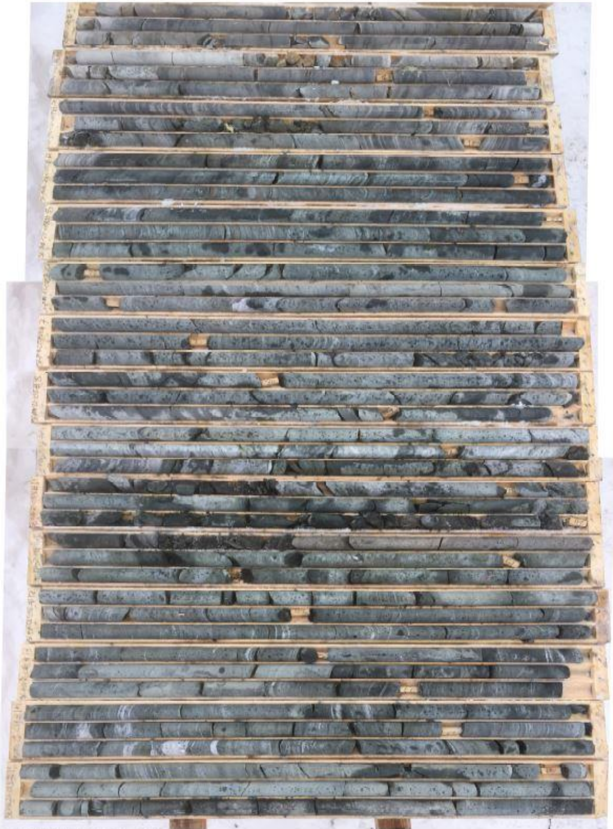
DDH SX-MN21-018, 5 to 71m.