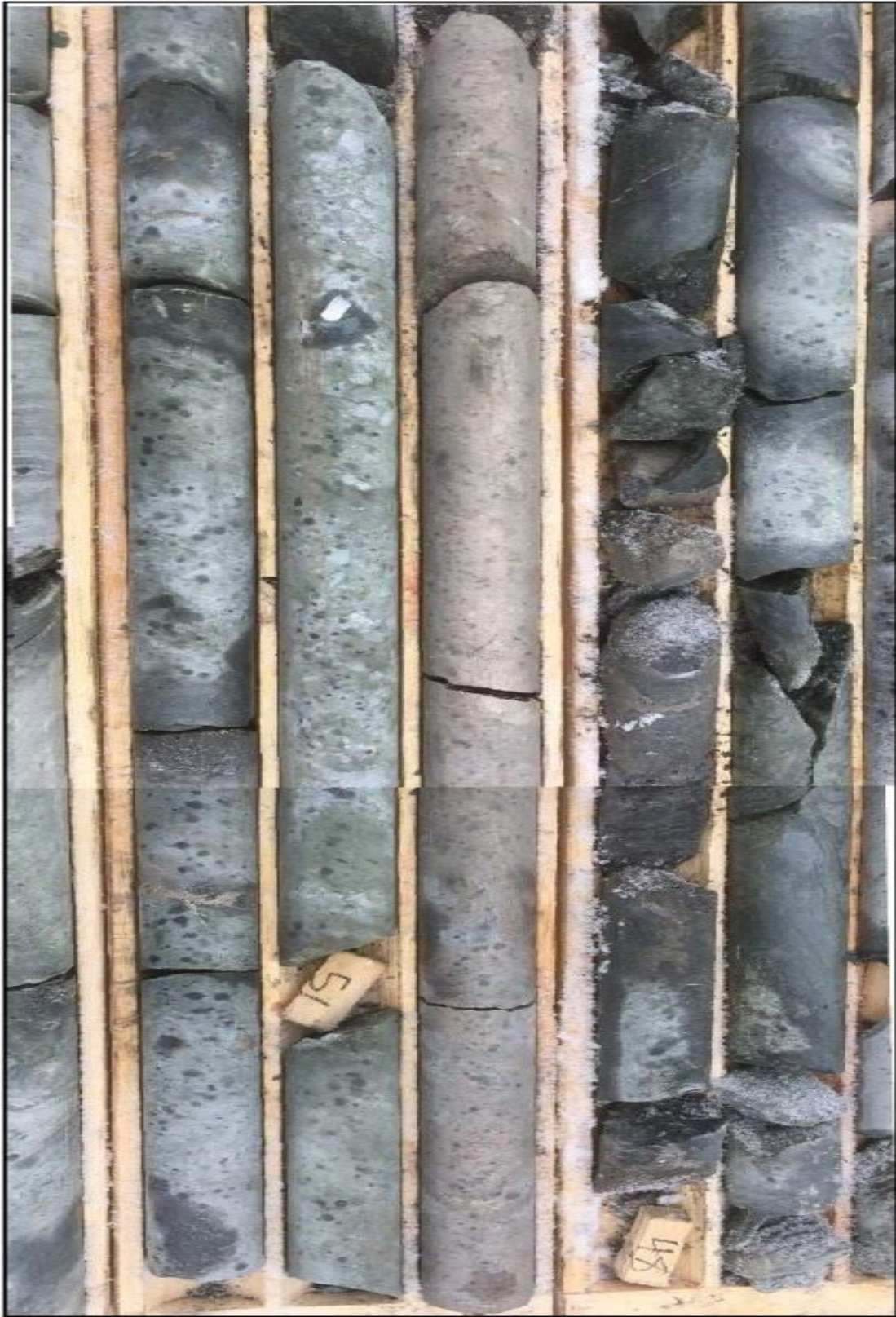
Field Picture of Hole SX-MN21-018 with sections of massive to semi-massive sulphides from 47.5m to 52m.