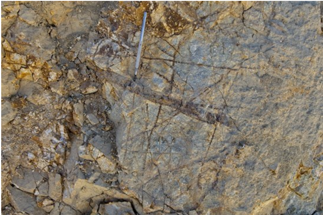
Figure 3 - Early quartz diorite porphyry with strong A veining exposed along road segment to drill pad #3.

https://images.newsfilecorp.com/files/10375/291715_55fdebf144ff4804_002full.jpg