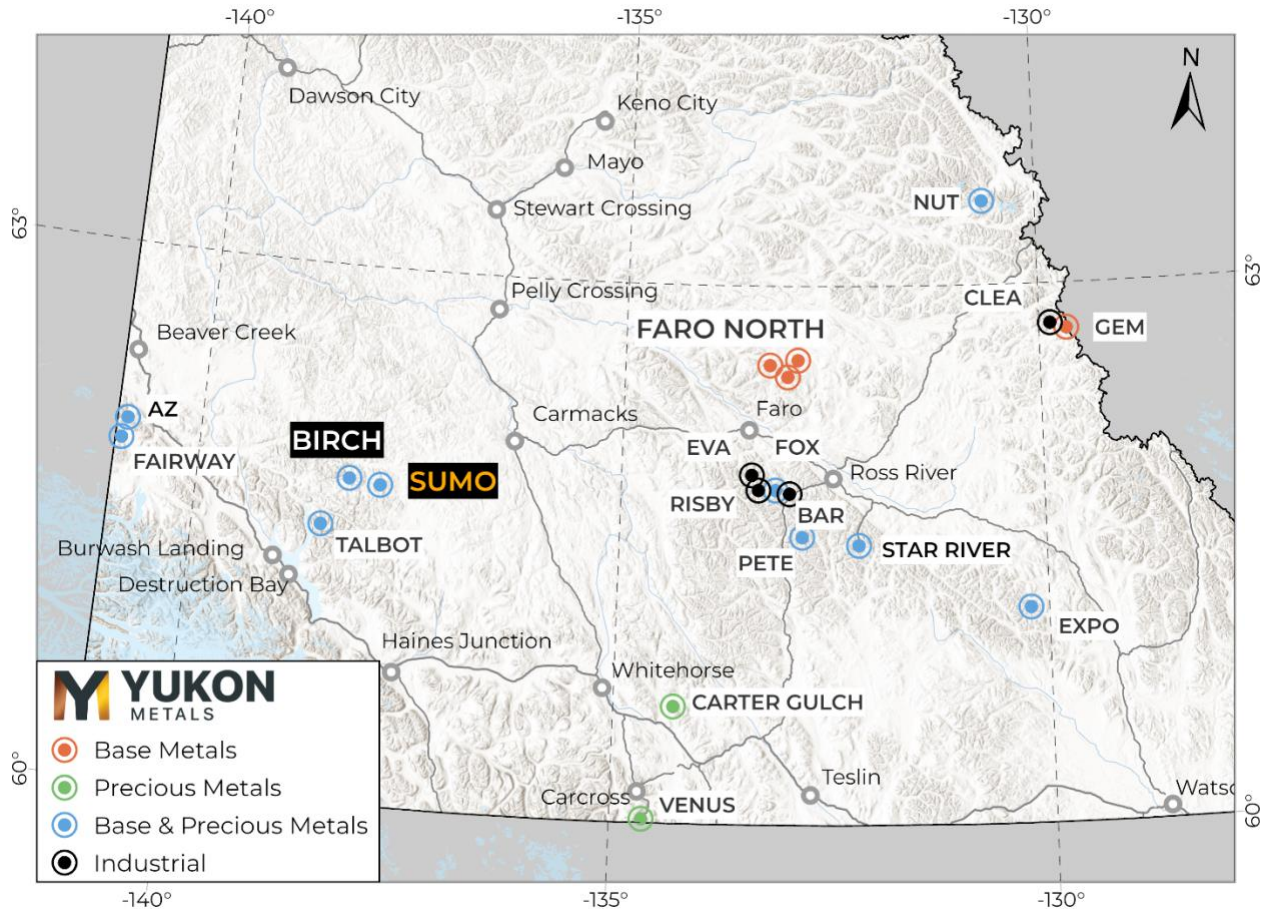
Figure 1- Location of the Sumo Property and other Yukon Metals projects in the region.

and separated by only 10 kilometres, the similarities between the two present a compelling opportunity to advance an integrated exploration program. This acquisition meaningfully adds to Yukon Metals' copper-gold exploration thesis.”