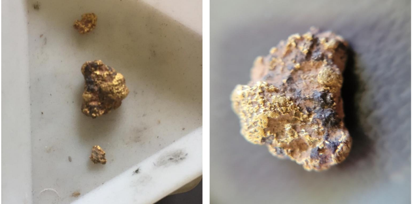
Figure 2 - Gold nuggets recovered from the Magazine grid along the Camp Hill Range (left), and a close-up of the 1.9g gold nugget on the right (larger nugget is approximately 1 cm across; photos courtesy of Dave Kiely).

Approximately 1,000 samples from the top of bedrock will be collected for analysis of the clay fraction for gold and a multi-element suite using an Aqua Regia digestion followed by inductively coupled plasma mass spectrometry (ICP-MS) analysis. Samples will be analyzed in the field using a portable X-ray spectrometer prior to shipment to the laboratory to allow for immediate in-fill sampling of some areas. Data quality will be assessed using a comprehensive QA/QC program involving the use of field duplicates and certified reference materials.