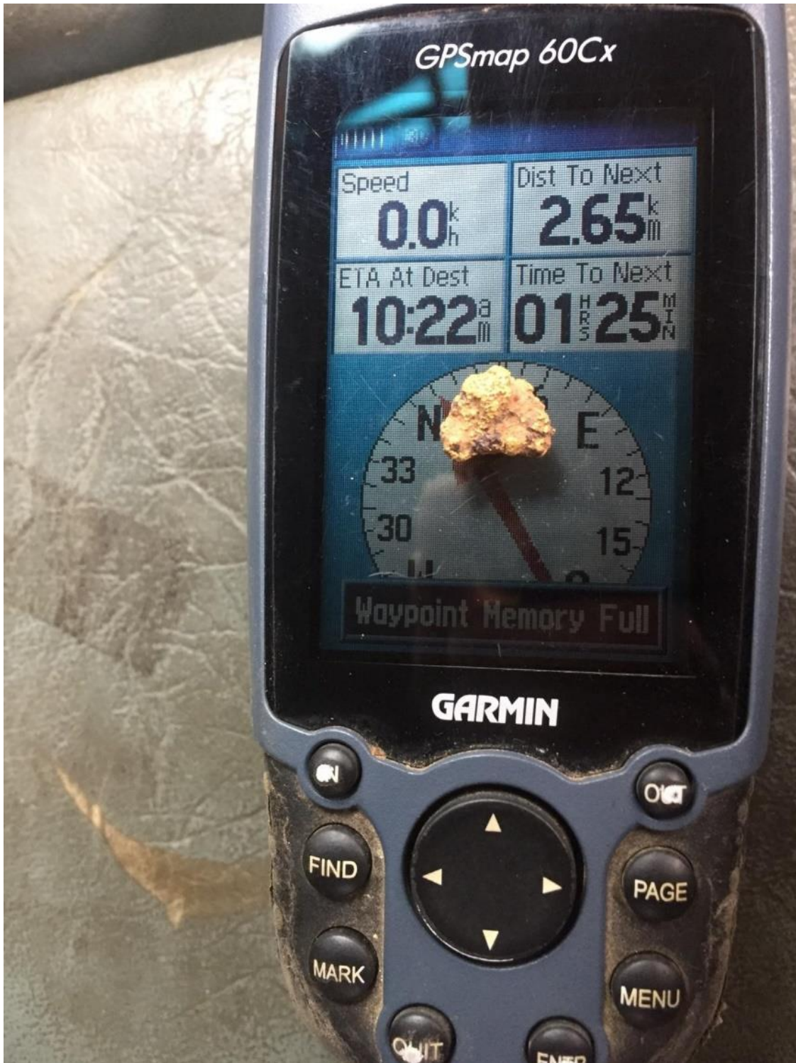
Figure 1 – 1.9g gold nugget intergrown with iron oxides recovered from the Magazine Block