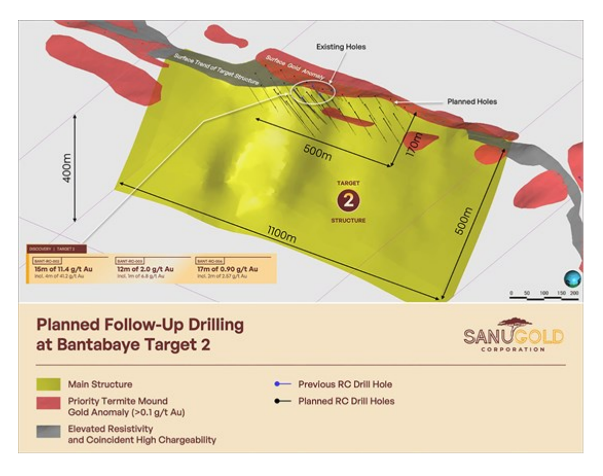
Figure 2: Target 2, orthographic view towards the northwest and slight down from above. 3D model of the main structure at Target 2 and Phase 1 follow up drilling, integrating the geophysics, surface data and drilling data. The grey polygon at surface is the surface trend of the key structure mapped by elevated resistivity and coincident high chargeability.

To view an enhanced version of this graphic, please visit: <u>https://images.newsfilecorp.com/files/8941/206092_26ca5833c43eeb6f_002full.jpg</u>