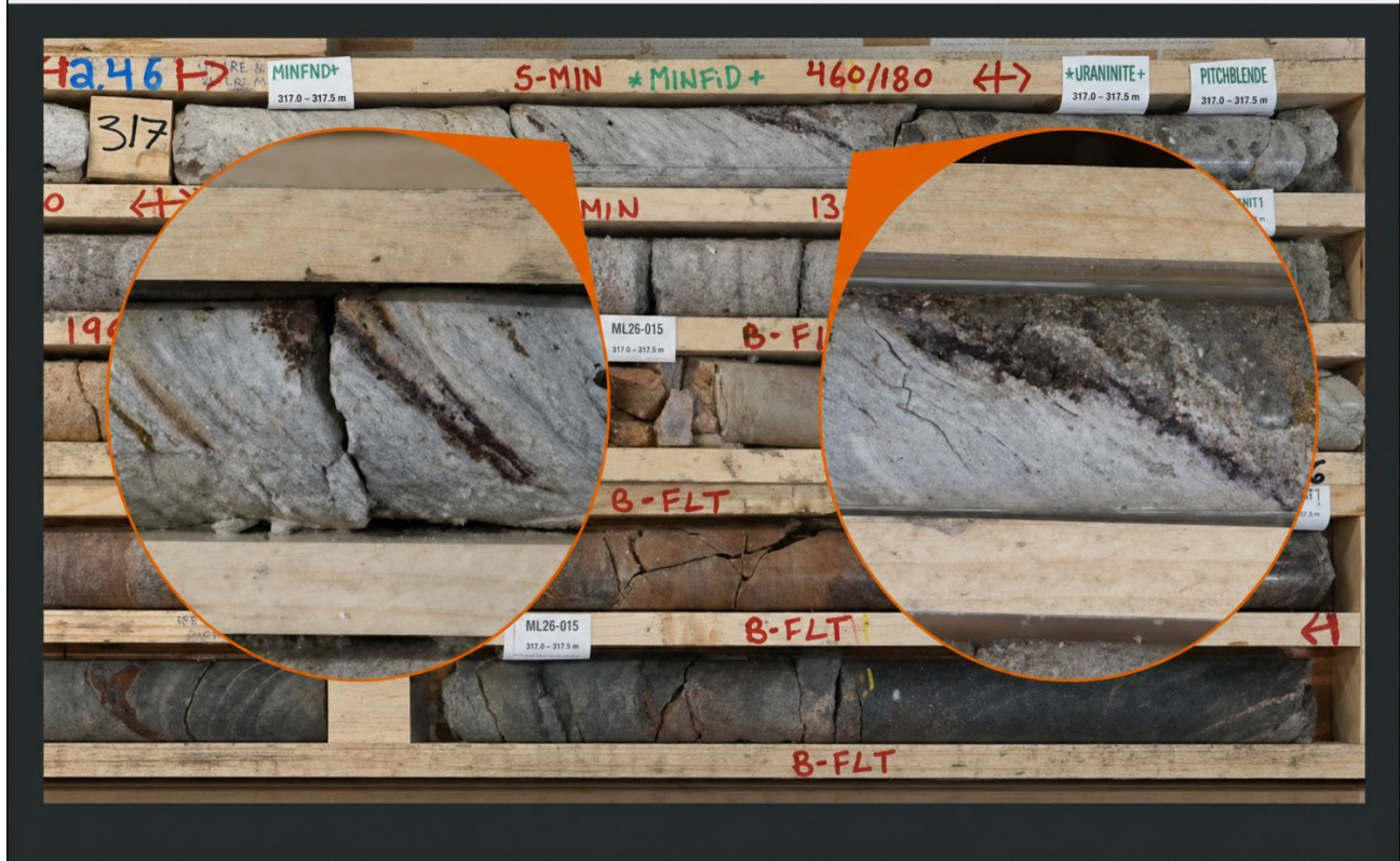
Figure 2. Visually identified pitchblende in drill hole ML26-015, 317 to 317.5 metres