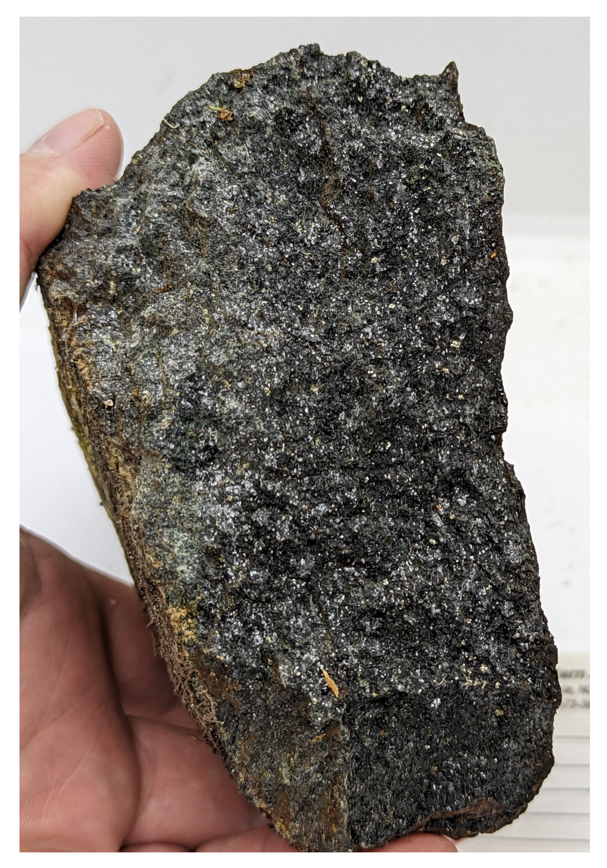
Figure 1: Sample 702985 from the high-grade Bailey Zone