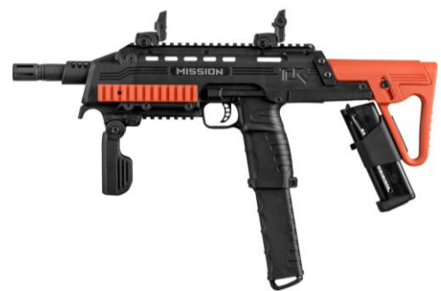
Mission Less Lethal’s signature product, the TCR