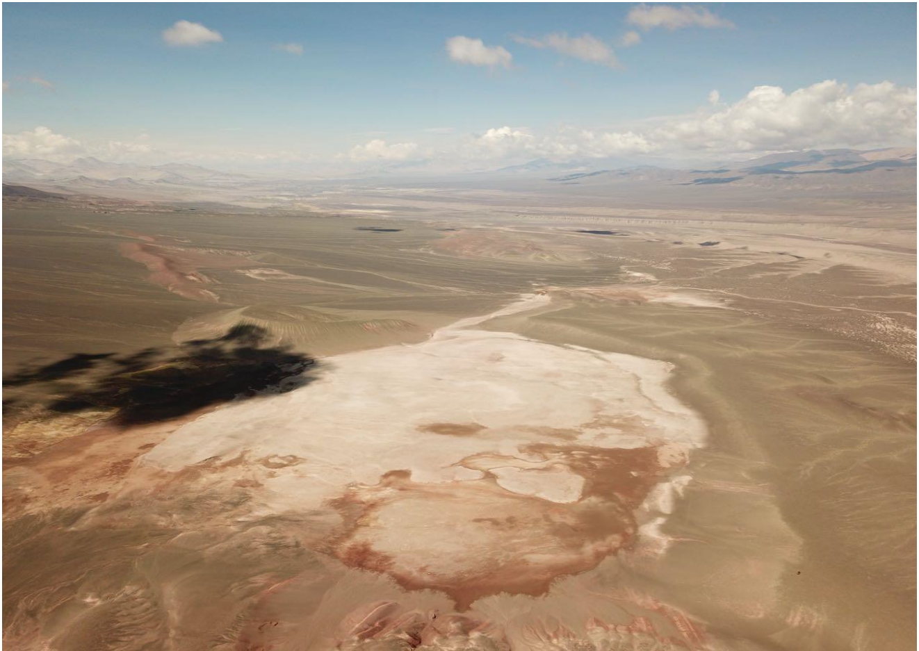
Figure 2: Aerial View of the Los Sapitos Project

As part of the acquisition, Origen has made an application to acquire the rights to an additional 21,363 hectares of open ground, known as the La Rioja exploration area, within this new prospective lithium belt. Approval of these applications are pending.