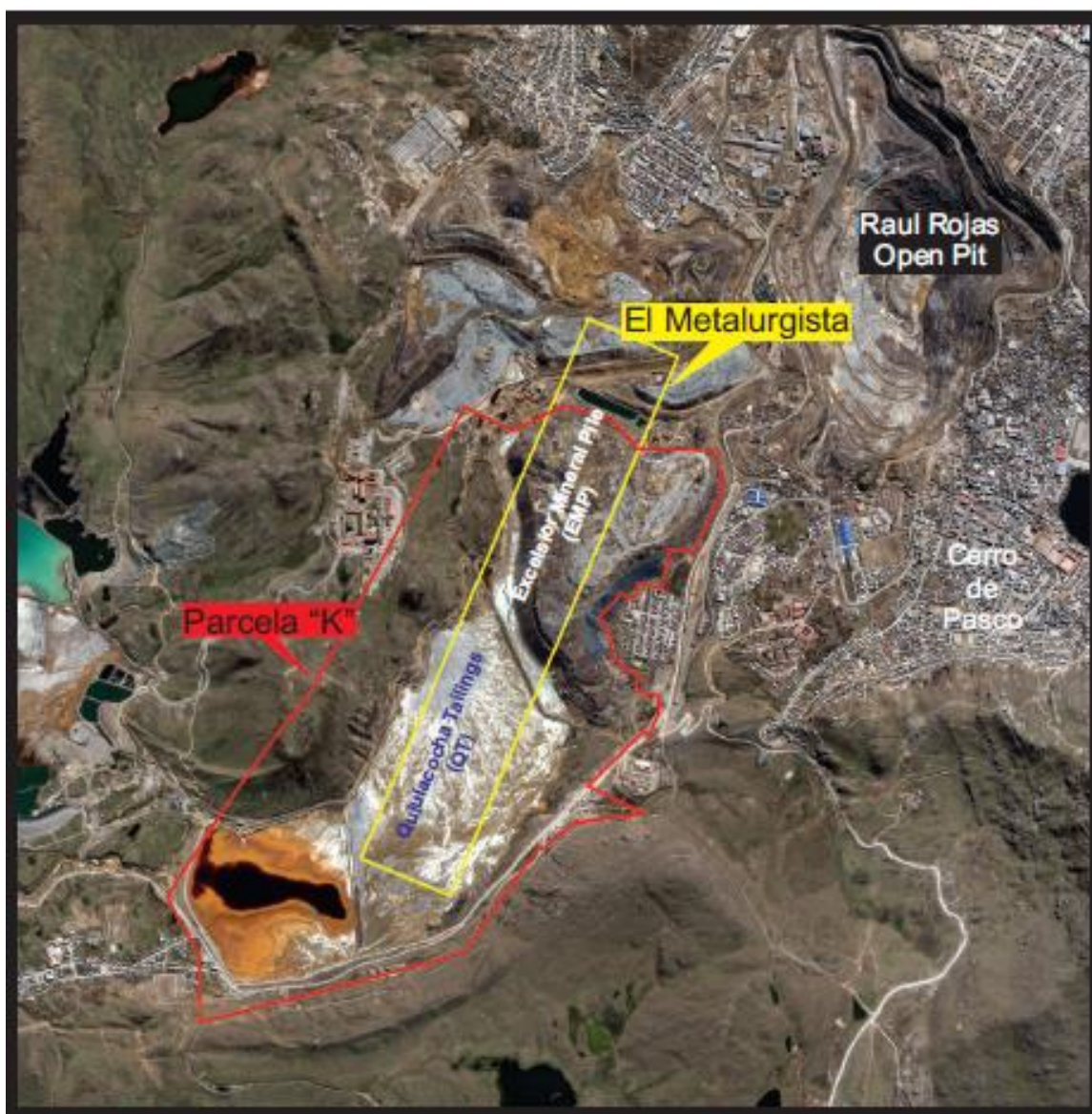
Figure 1: Localization and boundaries of the El Metalurgista and Parcela "K" concessions.

The Excelsior property contains the Excelsior Mineral Pile (EMP stockpile) and the Quiulacocha Tailings. The proposed plan for building the mining installations and infrastructures implies the use all available space located at the right side margin, NW of the QT and EMP sites within the Parcela "K" concession.