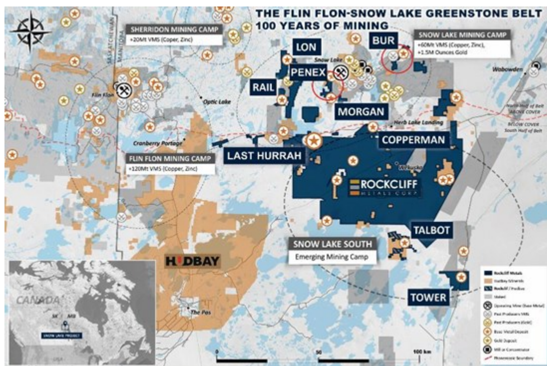
Figure 1: Location of the Bur and Penex Properties (circled in red) within Rockcliff's Extensive Land Position (in blue) will be the Focus of the Present Drill Program

Rockcliff remains the largest junior landholder in the in the Snow Lake mining camp area within the Flin Flon-Snow Lake Greenstone Belt (see Figure 1 below).